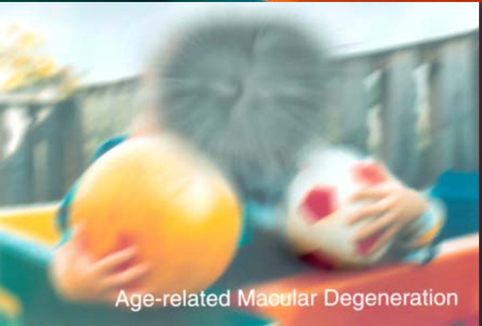
Age-related Macular Degeneration